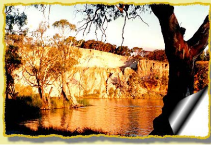
Celebrating our 11th year